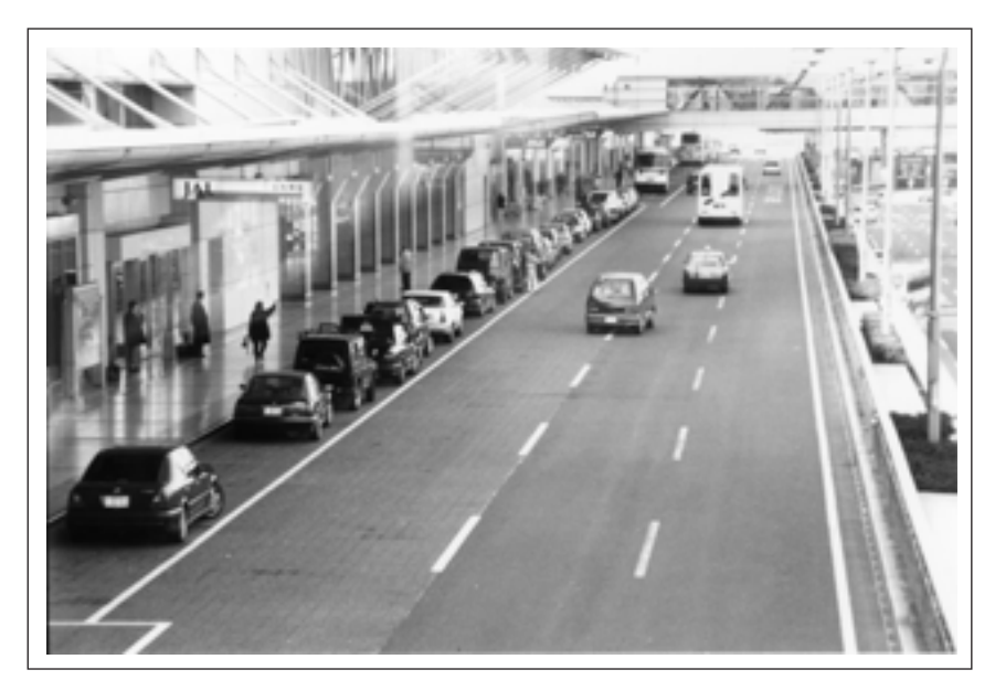
airport terminal, so

You will have eight minutes to complete this part of the test.